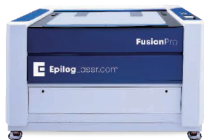
Fusion Pro 24 (CO2)